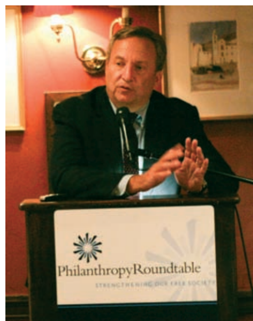
Former Harvard president Lawrence Summers gives the keynote address.