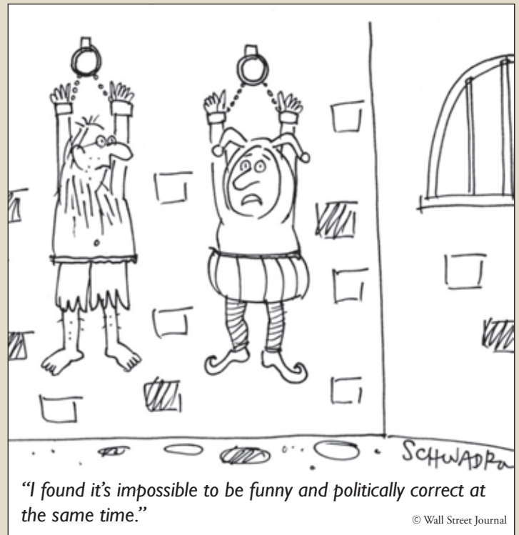
"I found it's impossible to be funny and politically correct at the same time."