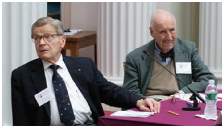
John Silber and William Theodore de Bary