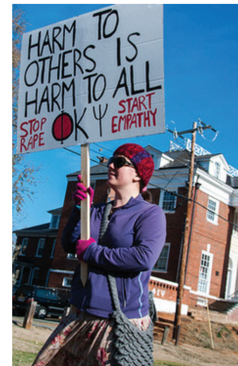
Student protester at UVA’s Phi Kappa Psi house.